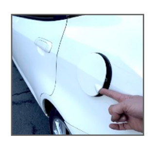
If you are using our white Fit, open the fuel rid manually by hand.